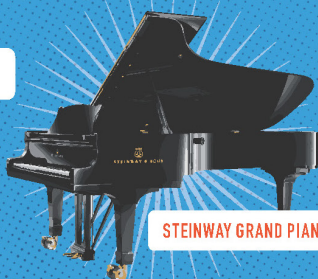
STEINWAY GRAND PIANO