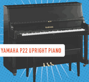
YAMAHA P22 UPRIGHT PIANO