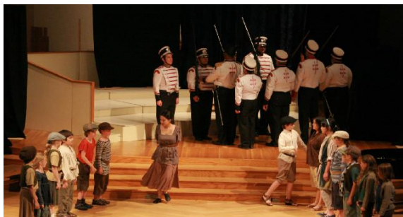
Repertory Opera Company, Pomona with CCSM Students